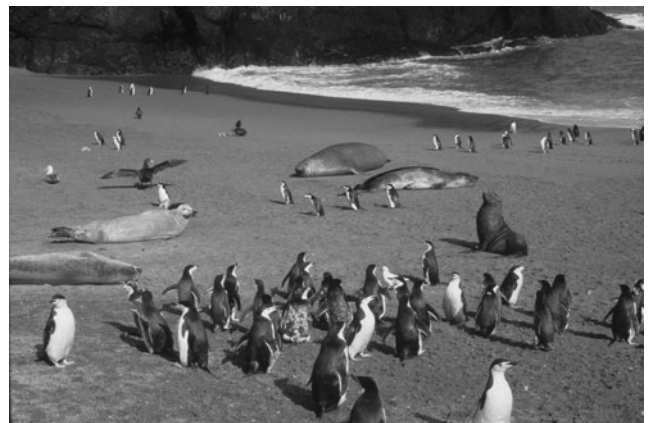
Fig. 3. A beach scene that includes four species of seals (Weddell, elephant, leopard, and fur), that was photographed at Seal Island in the Antarctic Peninsula Region. This scene is probably a look into the future of seal habitat use as sea ice areas decline.

Each of the Antarctic pack ice seals relies on certain species-specific sea ice characteristics to complete its annual cycle as part of its respective life-history strategy (Erickson et al. 1971, Gilbert & Erickson 1977). Our predictions about probable sensitivity to climate-change related alterations in habitat (Table I) suggest that the crabeater seal will be the most affected, with the Weddell seal following closely behind. Any environmental change that would decrease the size and thickness of floes (IPCC 2007) would probably increase competition among (and predation on) seals, especially crabeaters because females require floes that do not melt before the period of lactation is complete.